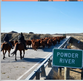
The Original Crump Operation

“...we began making our cows work for us instead of us working for them...”